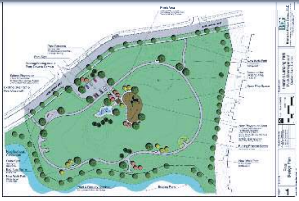
Heron's Landing development plan