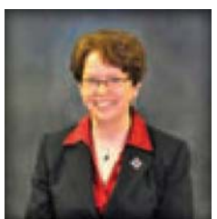
MARIANNE CORDELL COMMISSIONER