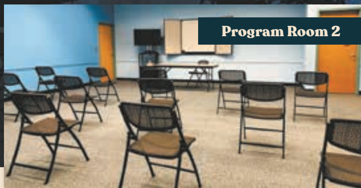
Program Room 2