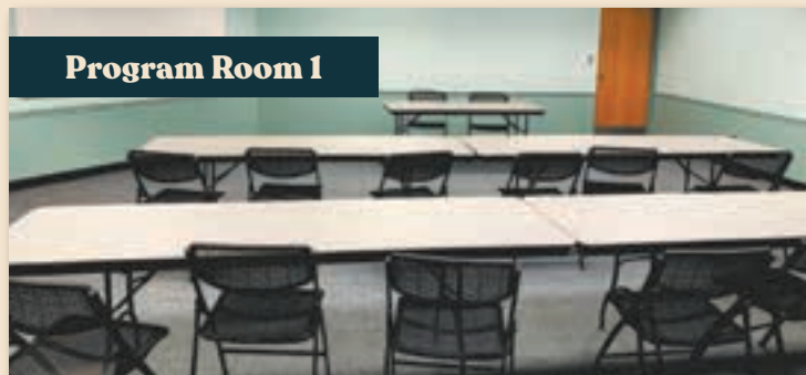
Program Room 1