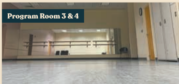
Program Room 3 & 4

Accommodates approximately 40 people and has a carpeted floor.