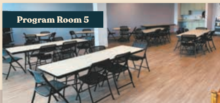
Program Room 5

Accommodates approximately 30 people and has a dance floor with mirrors on one wall, a dance barre, and a small sink with a counter. It can be combined with Program Room 3 to hold 60 people.