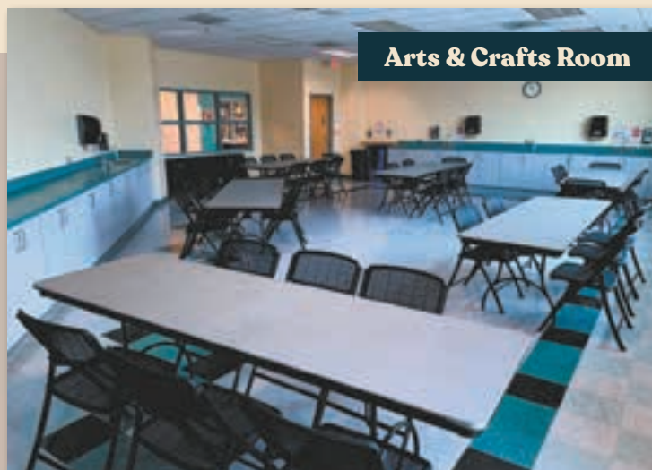
Arts & Crafts Room

Party Place is a great place for celebrating and hosting your next party. Select one of our specially priced theme packages or rent the room and do your own. Party Place Rooms accommodate 20 guests each and can be combined for a total of 40.